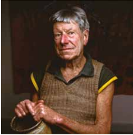
Barry Brickell in his studio.